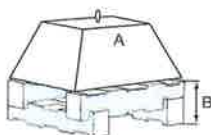
LPC4401 2 Box Crib

A = Maximum weight 27,2 ton B = Maximum stack height 1143 mm