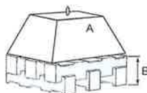
LPC4401 3 Box Crib

A = Maximum weight 27,2 ton B = Maximum stack height 1143 mm