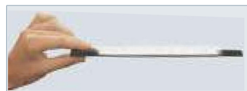
Ultra slim height of only 11mm. Lamp shown active.