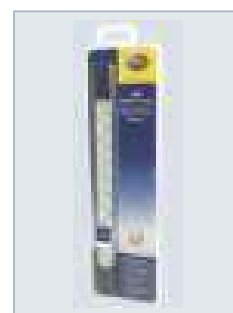
P/N 1009-BL (Single)