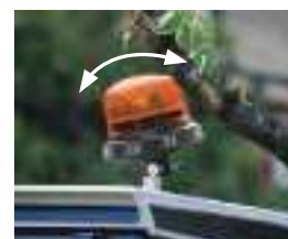
Extremely flexible pipe mount rubber base mechanism