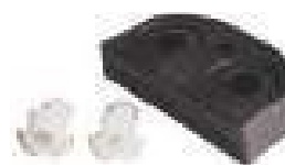
Mounting spacer P/N 9.2559.08