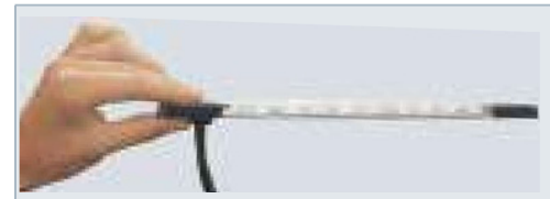
Ultra slim height of only 11mm.