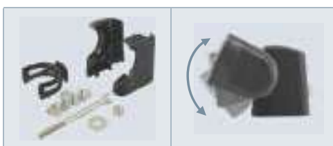
Single plastic bracket - disassembled view